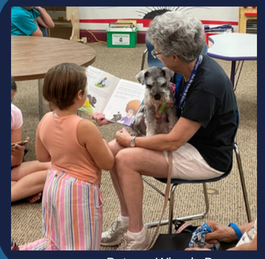
Pets on Wheels Program

Mayor of Cambridge, Steve Rideout, Summer Reading Kickoff Party