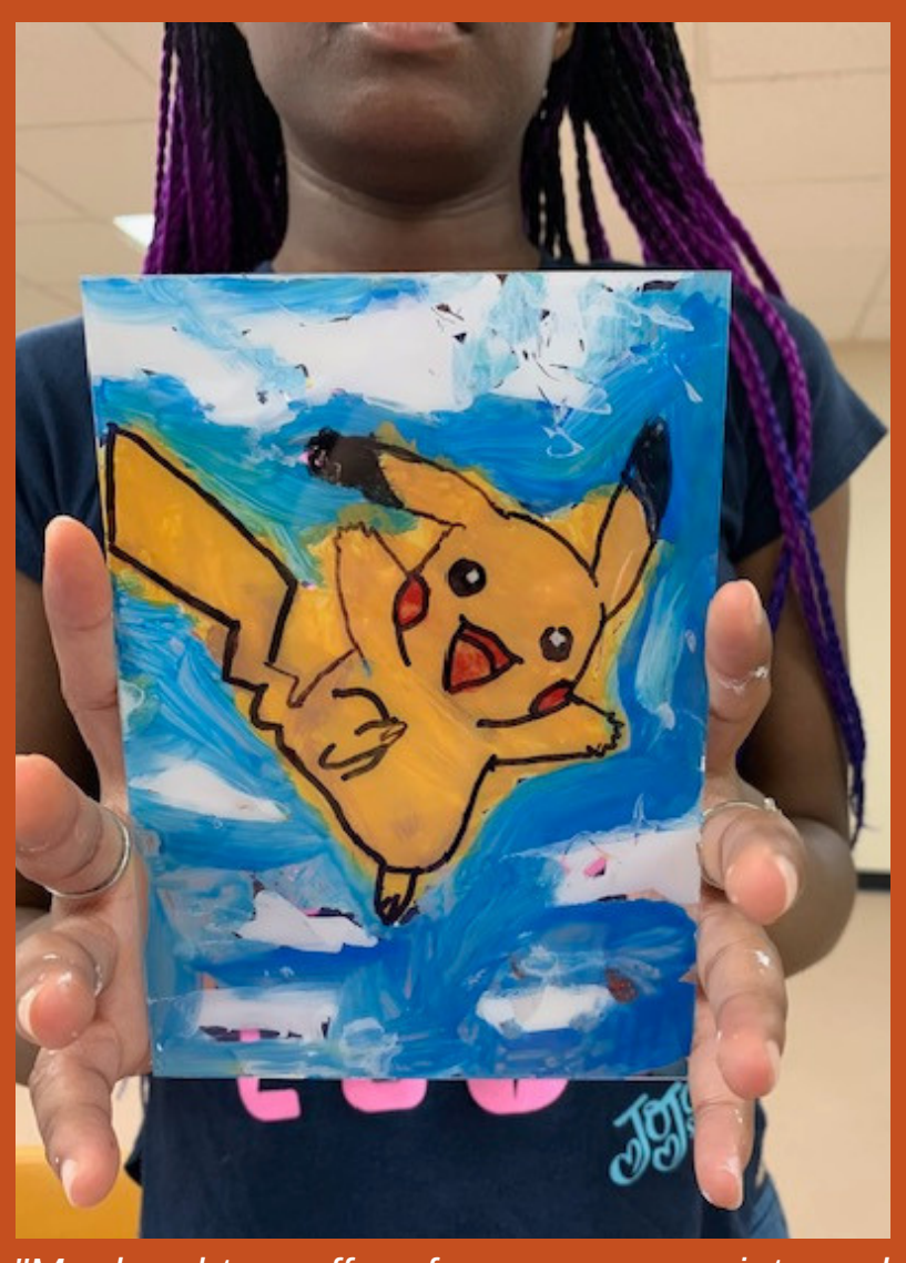
"My daughter suffers from severe anxiety and depression. Bringing her to [Teen] Anime Club has helped her immensely.