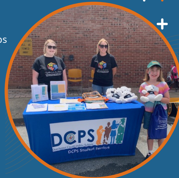
Summer Reading Kickoff, 2023

people were assisted by Cambridge Library staff,