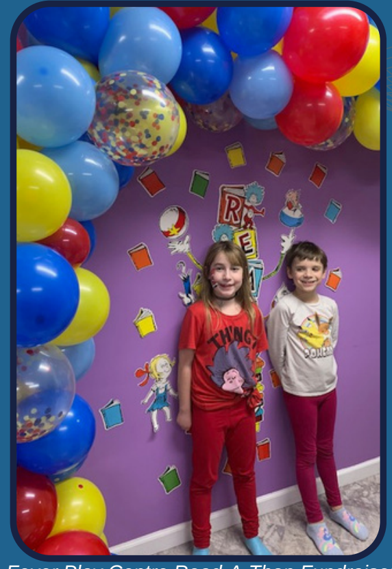
Cabin Fever Play Centre Read-A-Thon Fundraiser

Dorchester County Health Department Dorchester County Health Education Center Dorchester County Public Schools Dorchester County UMD Extension of 4-H Dorchester County Youth Action Council